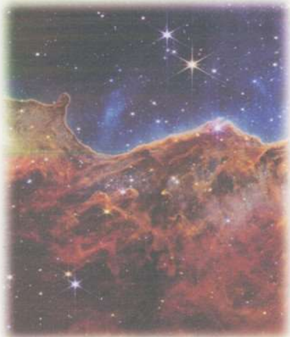
One of the first images taken by the James Webb Space Telescope pictures region NGC 3324 of the Carina Nebula. Many stars are born in this region.