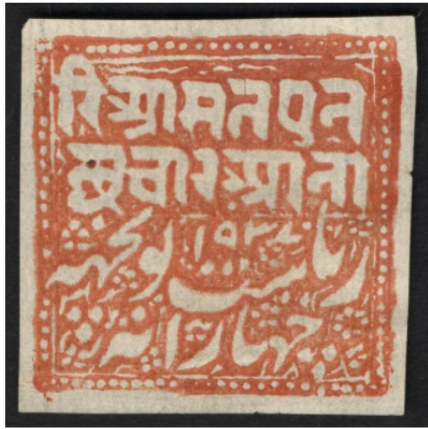
4a Numeral single

A former tributary state of Jammu and Kashmir in northern India. Poonch's issues were replaced by those of India in 1894.