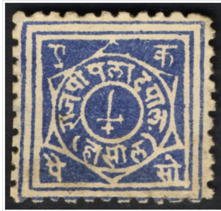
1pa Kandjar (Indian daggers) single

A former feudatory state in western India.