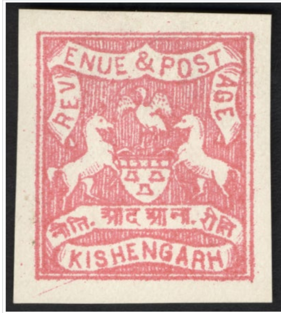
1/2a Coat of Arms single