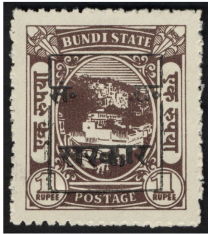
1r overprint on stamp of Bundi single

A state in northern India created by the merger of 18 Rajput states , several of which had hitherto issued their own stamps.