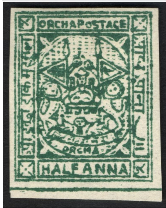
1/2a Seal of Orcha single

A former feudatory state in the Bundelkhand agency in central India. On May 1, 1950, Orchha's issues were replaced by those of India.