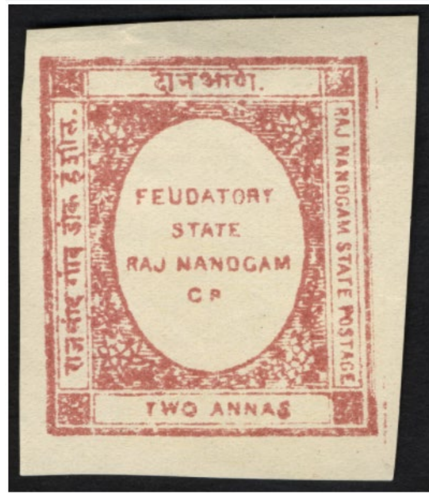
2a Numeral single

A former feudatory state in central India. Nandgaon's issues were replaced by those of India in July 1895.